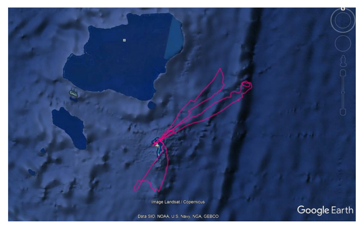
Figure 2. A suite of tracks of foraging RFBs from the breeding colony on DG.

Objective 3: To establish the status and distribution of breeding RFB on DG.