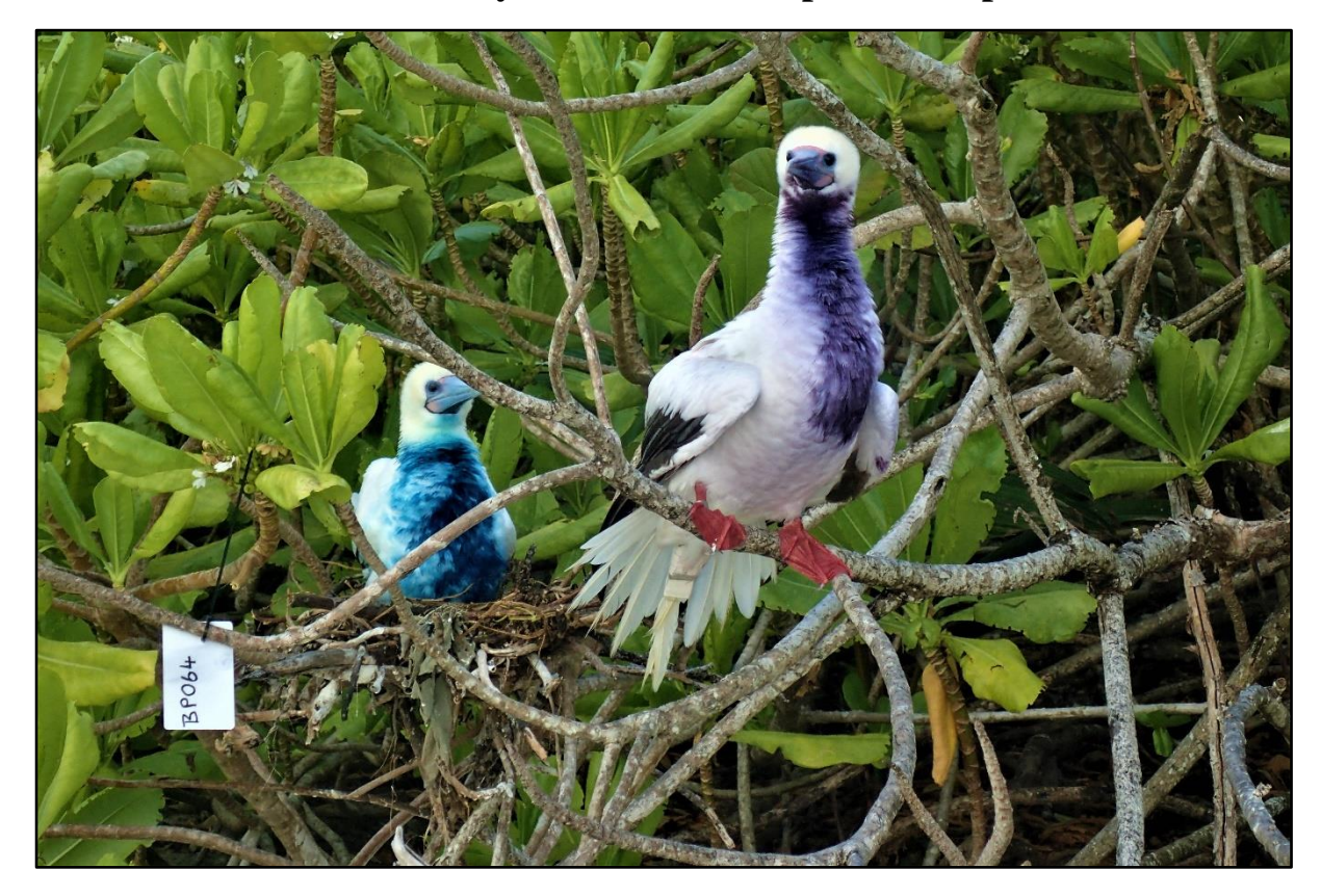
Figure 1. A pair of Red-footed Booby, both colour dyed for nest-monitoring purposes and the female (front bird), showing the GPS tag on the undertail for researching where this bird is feeding and foraging when out at sea in the Marine Protected Area.